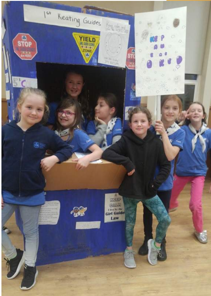
Above: The cookie selling Kiosk. Right: Cookie selling teamwork.