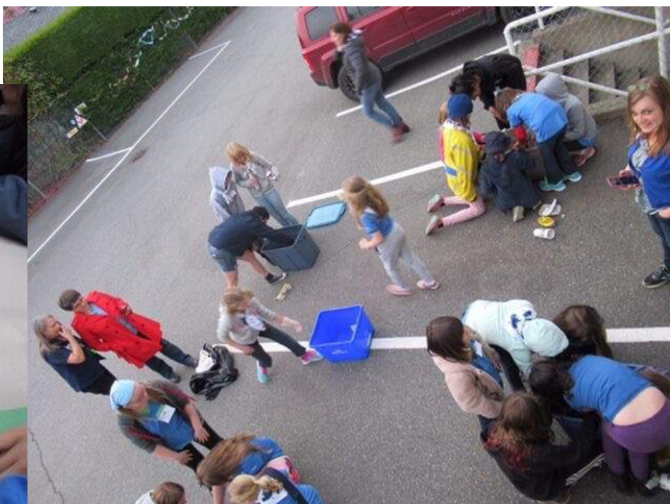
Left: Making the poster.