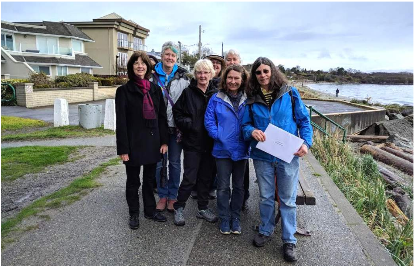
Above: First Victoria Trefoil Guild