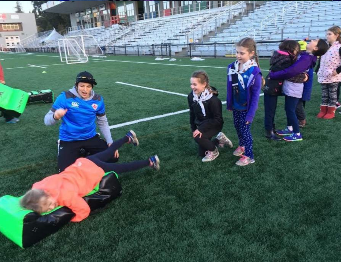
Top Left: Autograph time with Team Canada Rugby Players