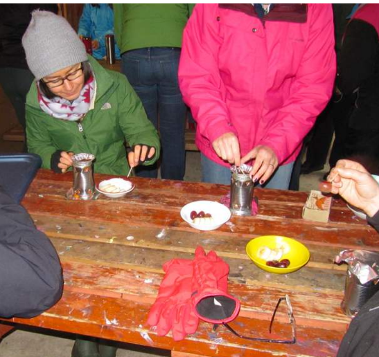
Clockwise from Top Left: Participants networking; Outdoor games; Camp ceremonies; Tin can chocolate fondue - who doesn't love fruit when it's covering in fruit.