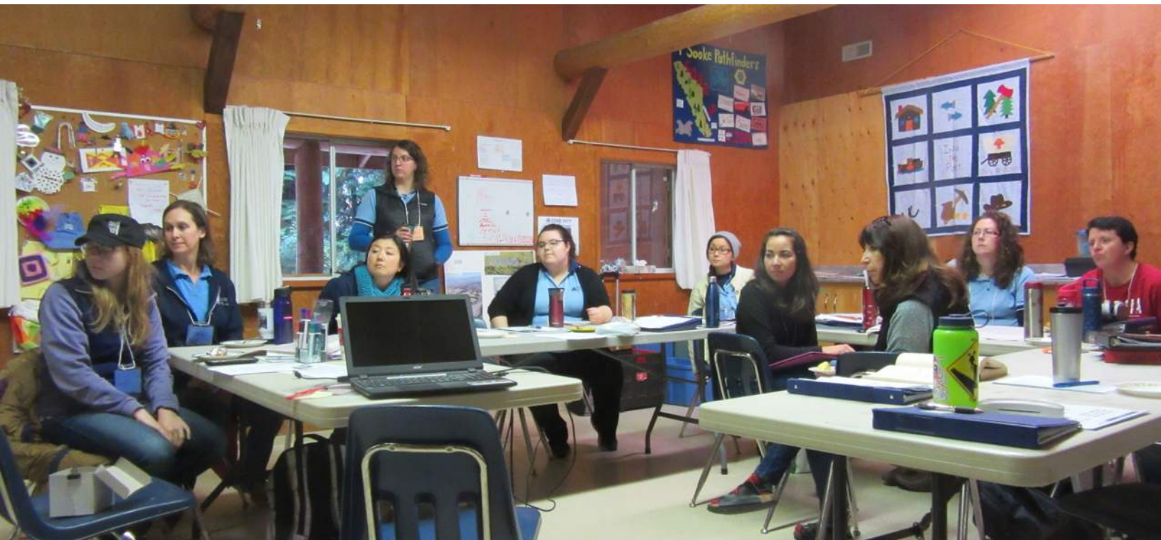
Below: Participants networking and listening to presentations.