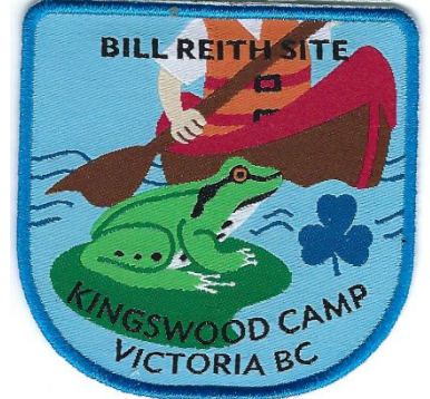
Kingswood camp crests

Upon confirmation of your booking you will receive further details about the camp, including arrangements for obtaining keys, paying your deposit and your fees. The deposit will be deducted from your camp fee total if you leave the site clean and secure and everything in good repair. Details of camp rental rates and subsidies for SVI Area members are at <a href="https://www.svigirlguides.bc.ca/camps">https://www.svigirlguides.bc.ca/camps</a>