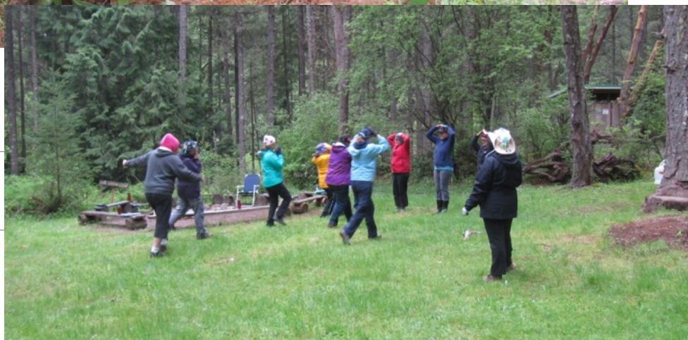
Right: Participants play "Oh Deer"