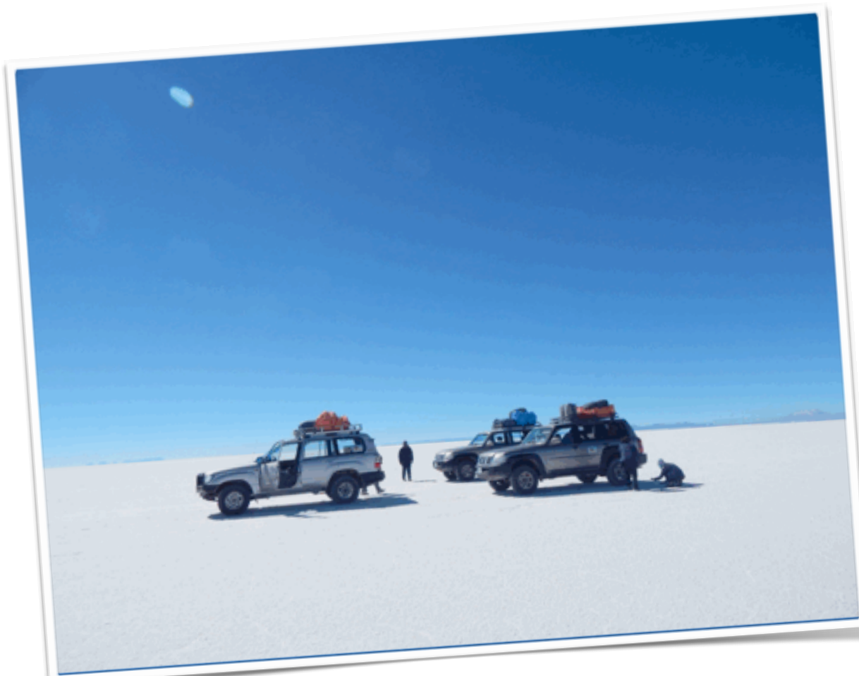
"We went on a 3 day tour of the Salar de Uyuni Salt Flats and it was an experience we will never forget"