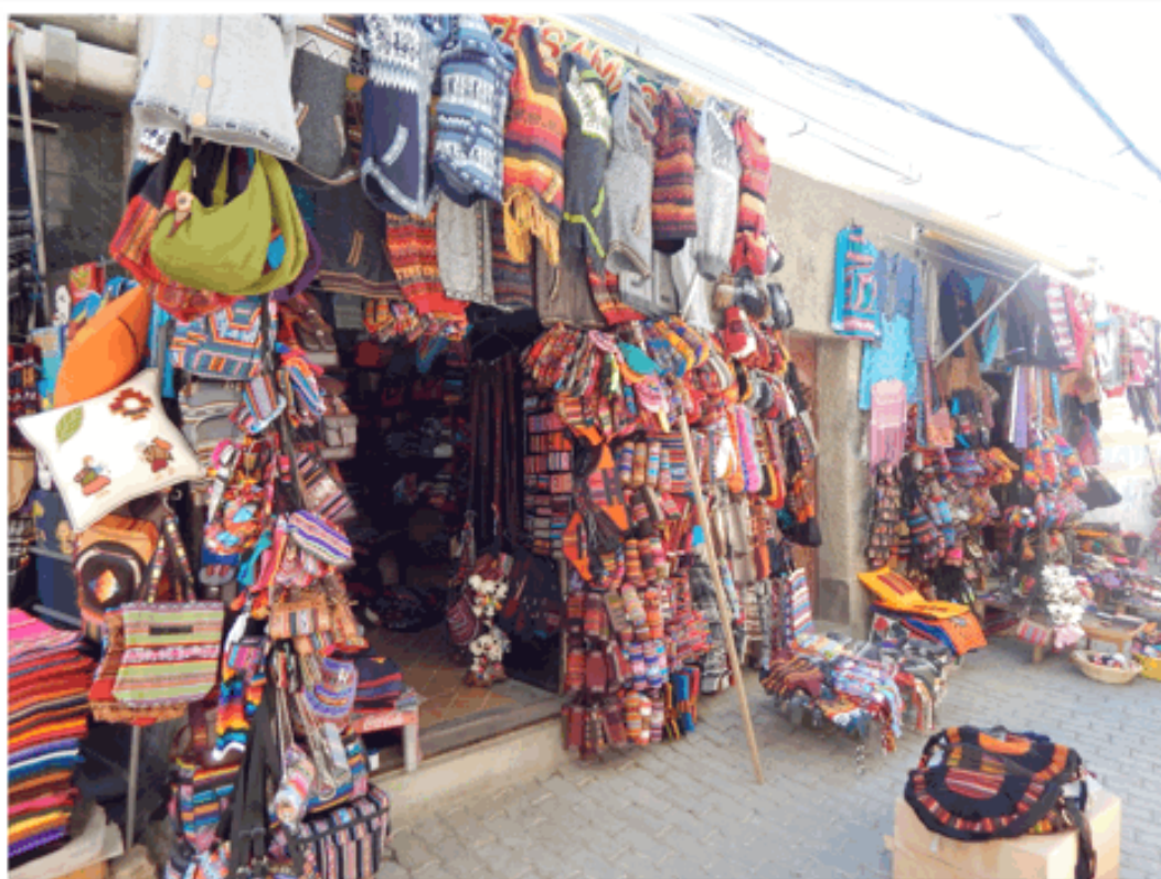
"The many colours of a traditional Bolivian market"

From there we flew into La Paz, Bolivia where the real adventure started. La Paz is a vibrant city of colour and motion and we were swept up in it. We loved shopping in the markets and seeing how the Bolivian people lived.