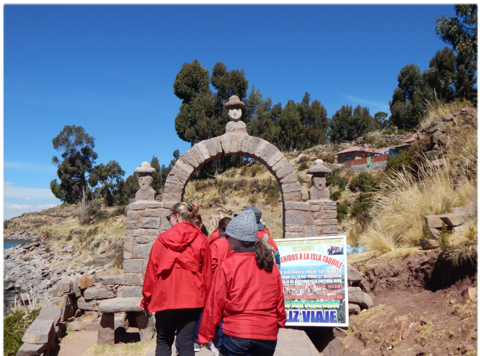
"Visiting Taquile Island on Lake Titicaca"

From there we visited and hiked on Taquile Island. The people there are known for the highest quality of handicrafts in Peru with the spinning and dying being done by the women, and the knitting exclusively being done by the men.